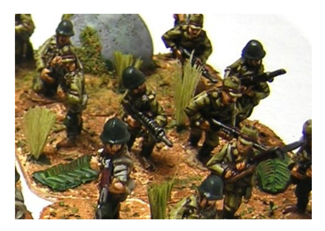
NOTE: <u>Do not use</u> the bottle called "923 Japanese Uniform", its way off, it has nothing but the name linked to Japanese uniform...