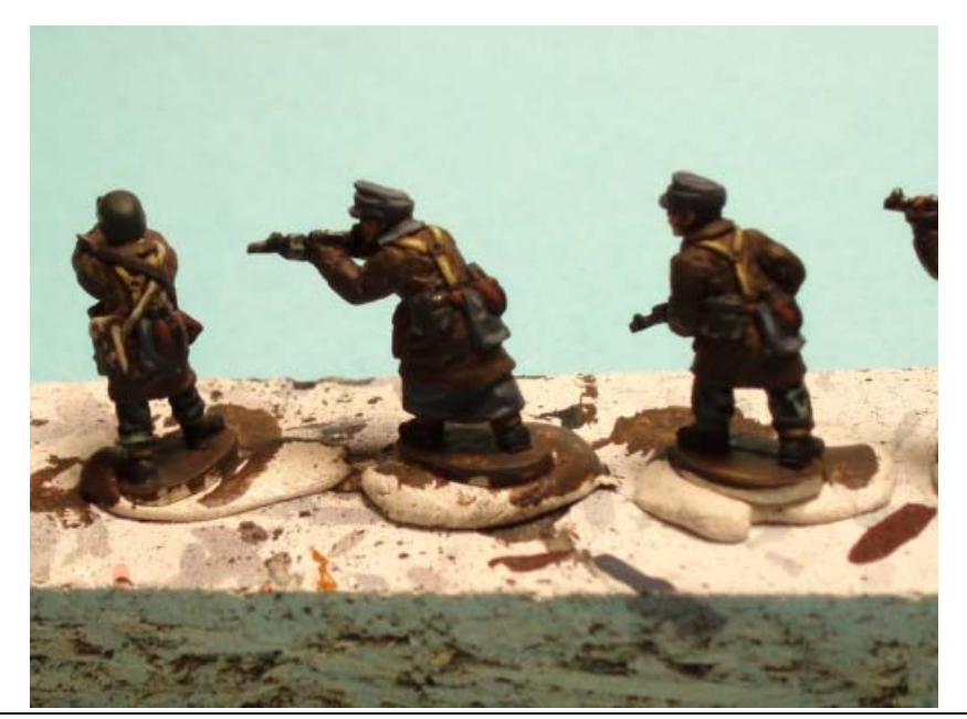
Painting a -LATE WAR- Tan Water Pattern - 1 -

Here is the base I am going to work with. I have painted before the camouflage all the equipment for aesthetic purposes. By the way, the soldier leaning forward is carrying a Late war copy of a Sten machinegun which I found totally cool.