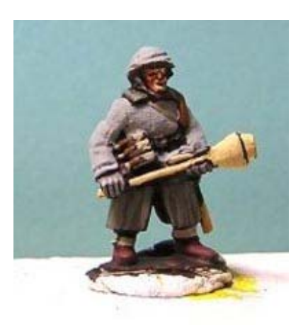
Note: the weapon, equipment and face of the figure were painted first for aesthetic purposes. We advise you to paint those last.

Step 2 Paint all white parts with 905 Pale blue-grey.